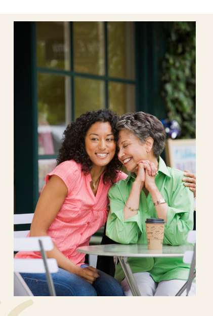
I learned to accept myself and not be ashamed. [I] started going to more training, meeting and support groups. I have also disclosed to my son. I have volunteered my time with others.