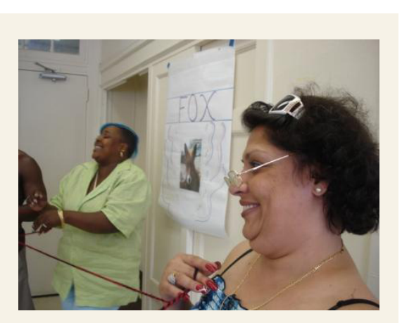
Two peers co-facilitating a training session.

The purpose of storytelling should be to keep infected and affected people adherent to care.