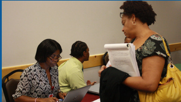
Working with clients to verify and maximize benefits