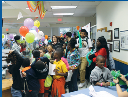
Students performing procedures and participating in community events

The College of Dental Medicine fosters leadership and excellence in dental education through a commitment to recruitment and retention of the highest caliber of self-motivated students, residents, and faculty members innovative teaching methods, research, scholarship, professionalism, and ethical principles continuing education, service to the local, national, and international communities.