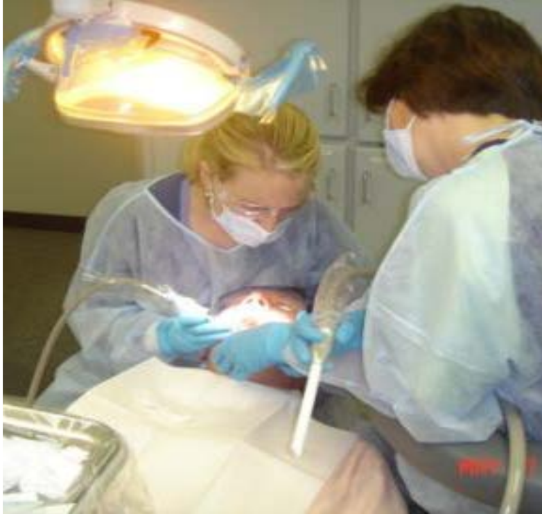
Two Hygiene Students performing a routine dental cleaning.